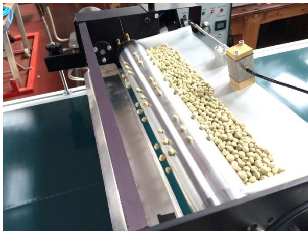
Peas sown 3 per pot

The new Mega Drum Kit is an attachment for the Hamilton Drum Seeder to allow much larger and heavier seeds to be sown than with the standard drum. The outer end plate of the seeder head is replaced, which allows the connection of a new vacuum source direct to the inside of a new type of drum, which has much larger holes than can be used on a conventional Duplex drum. Seeds such as corn, peas, pumpkin, sweet peas, squash, and many of the large tree seeds can be sown with a high degree of accuracy at high sowing rates. The new drum features an inexpensive outer sleeve, which can be replaced when changing seed sizes or trays. Sleeves can be drilled with multiple holes per cell/pot.